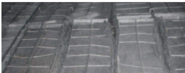
Figure 1. Mesh pad that was removed, cleaned, and no longer retains a proper fit when reinstalled into service, due to the handling and cleaning process.