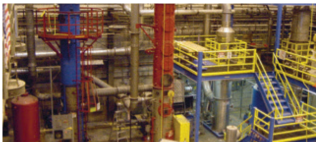
Figure 2. Koch-Glitsch test facility in Wichita, Kansas.